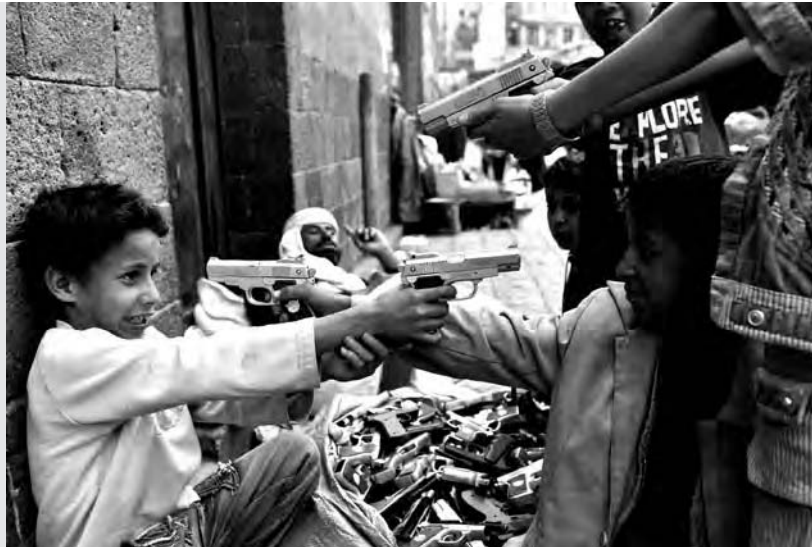
Kids playing with toy guns in Sanaa, Yemen.

Sustainability is always a critical point in externally funded programs. The contribution on and by AEQUUS is remarkable because it presents a grass roots initiative started and maintained by a group of local youth after a friend of them was shot by a gang. They decided that they must do something to provide better alternatives for their fellow youth in their extremely violent neighbourhood and being university students themselves, they began to provide free pre-university classes and other courses to young people from the barrio (living quarter). By doing so they already facilitated access to university studies for 60 other young people from the neighbourhood and helped others to learn English or to start an artistic career. What is especially remarkable is the silent support received from many gang members who send their younger brothers to participate in the educational offers of AEQUUS since they wish that they do not to follow their own fatal destiny and join one of the gangs.